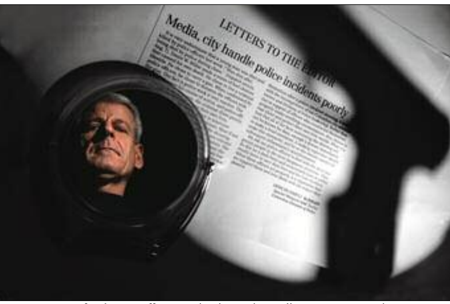
1st Portrait

A man cuts a lonesome figure on a country road between Winesburg and Berlin in Holmes County's Amish country.