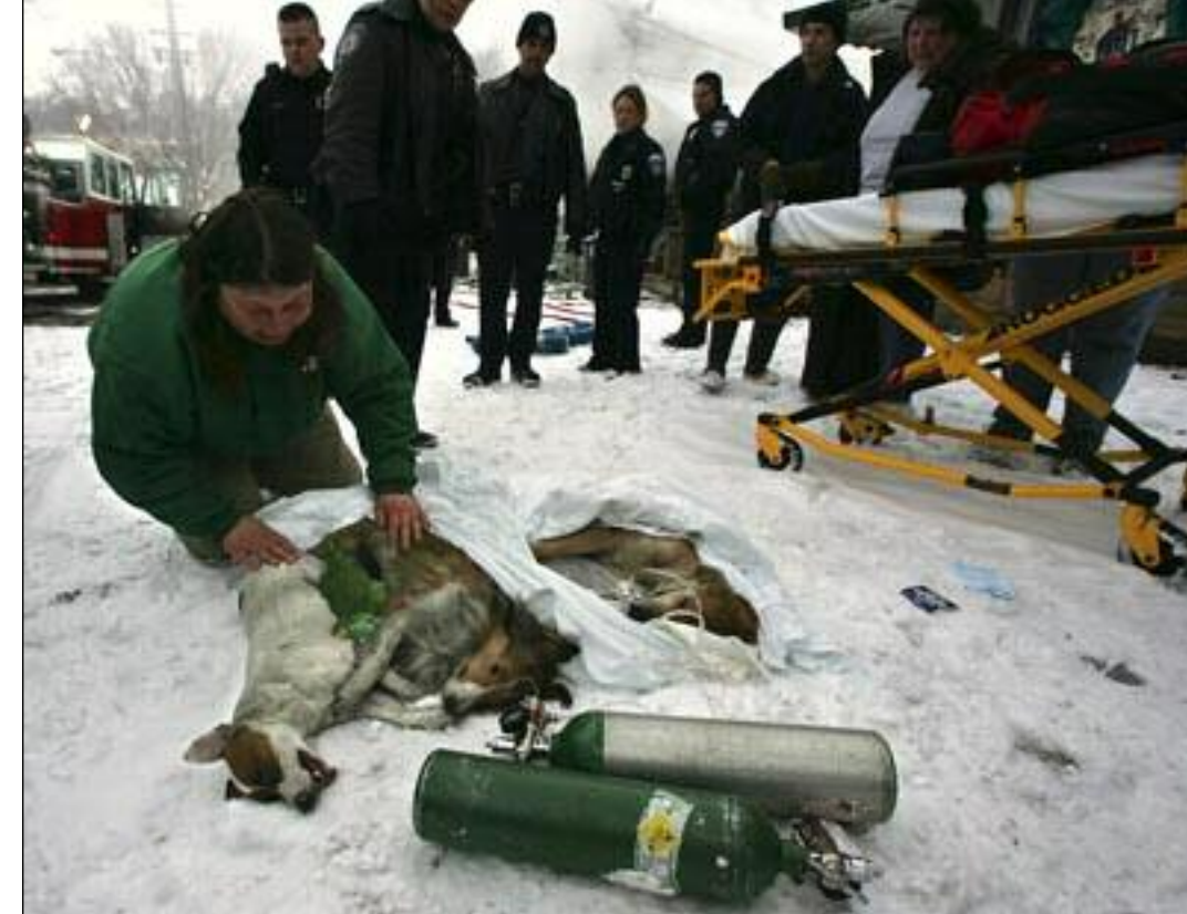
1st Picture Story