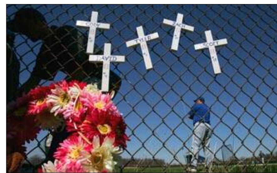
1st Picture Story