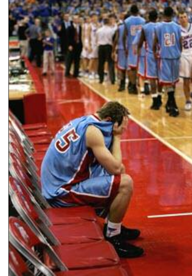
1st Sports Div III state semi-finals in Columbus.