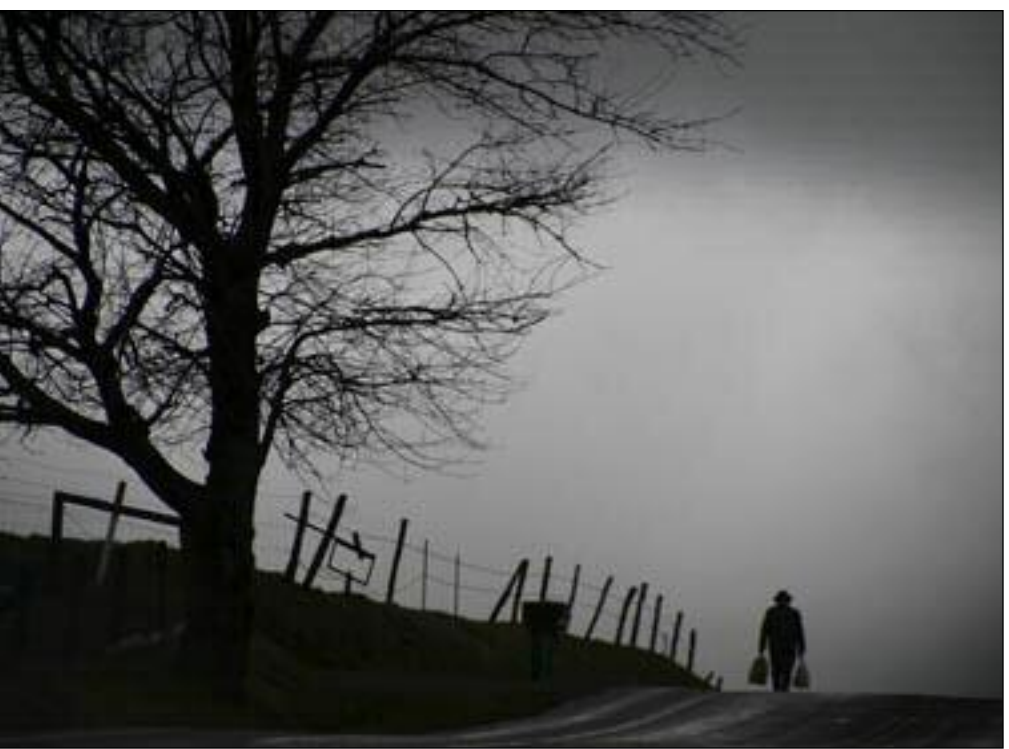
Mary Circelli The Columbus Dispatch 1st Feature

A deer killed by poachers lies frozen to the ground in a dump site along Kenton-Galion Road outside of Marion. The site also included raccoons and a beaver.