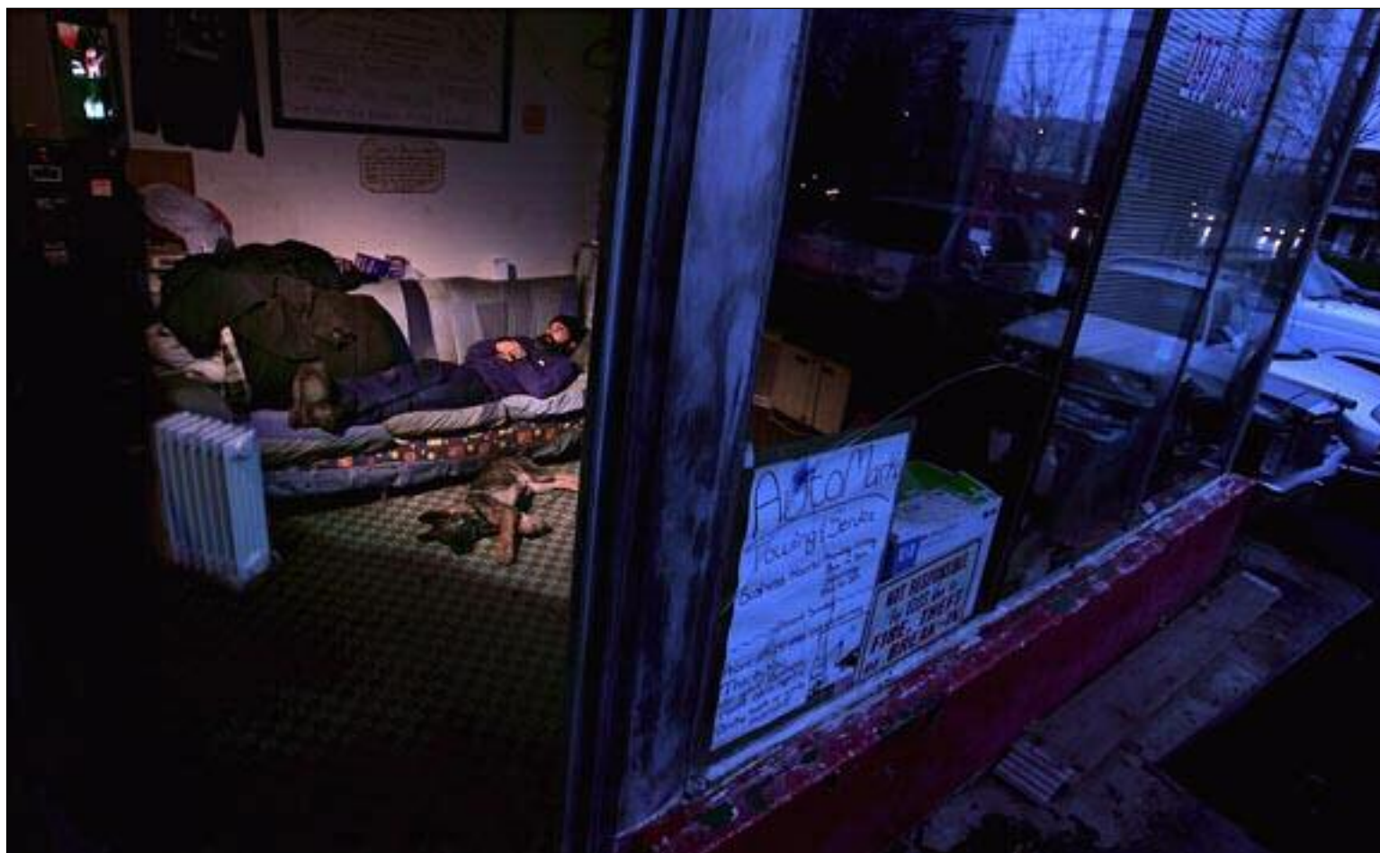
1st Portrait - December