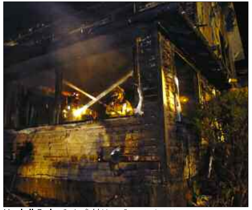
1st Spot News Members of the Springfield Fire Division take care of hot spots at a home in Springfield.

1st Feature