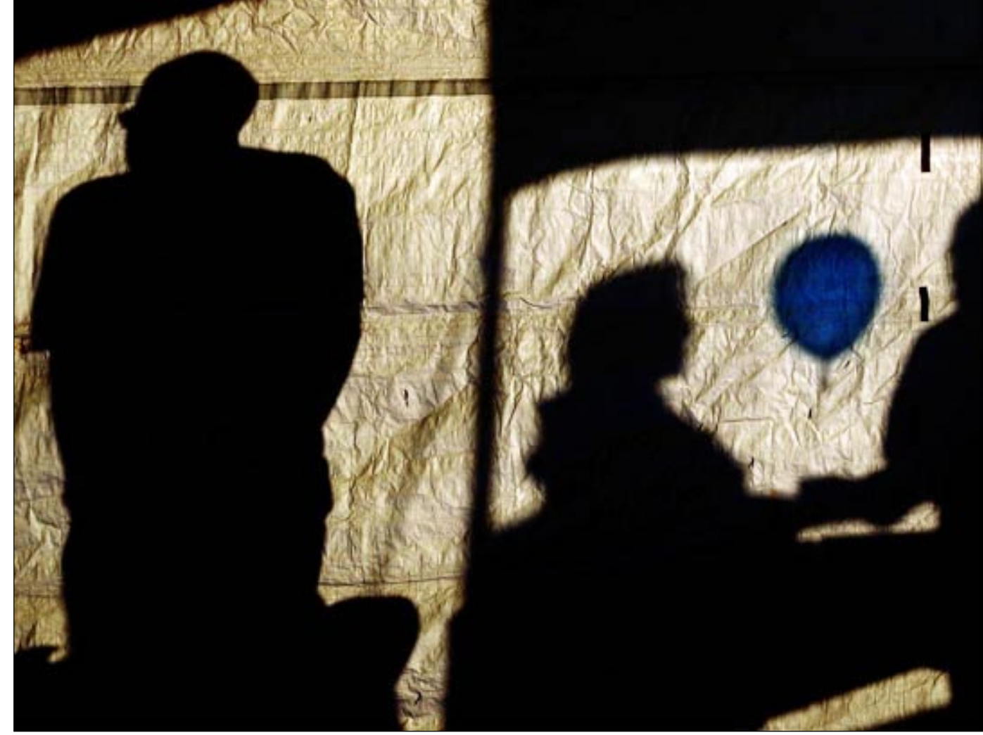
Greg Ruffing - The Morning Journal 1st Feature - June