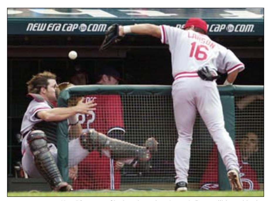
1st Sports - June

American children watch TV for almost three hours a day, more than triple the time they spend reading for fun.