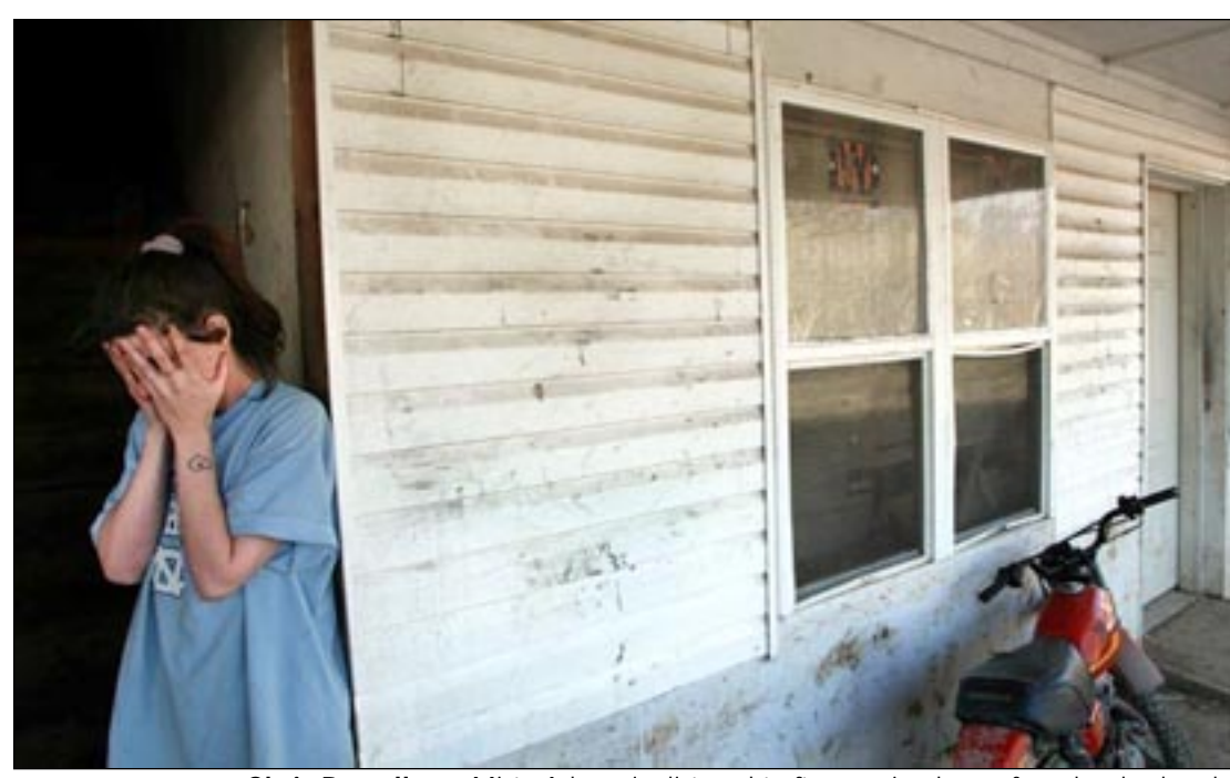
1st General News February