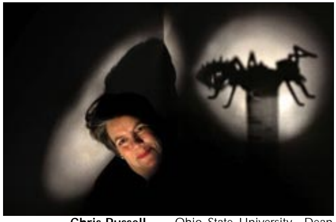
1st Portrait March