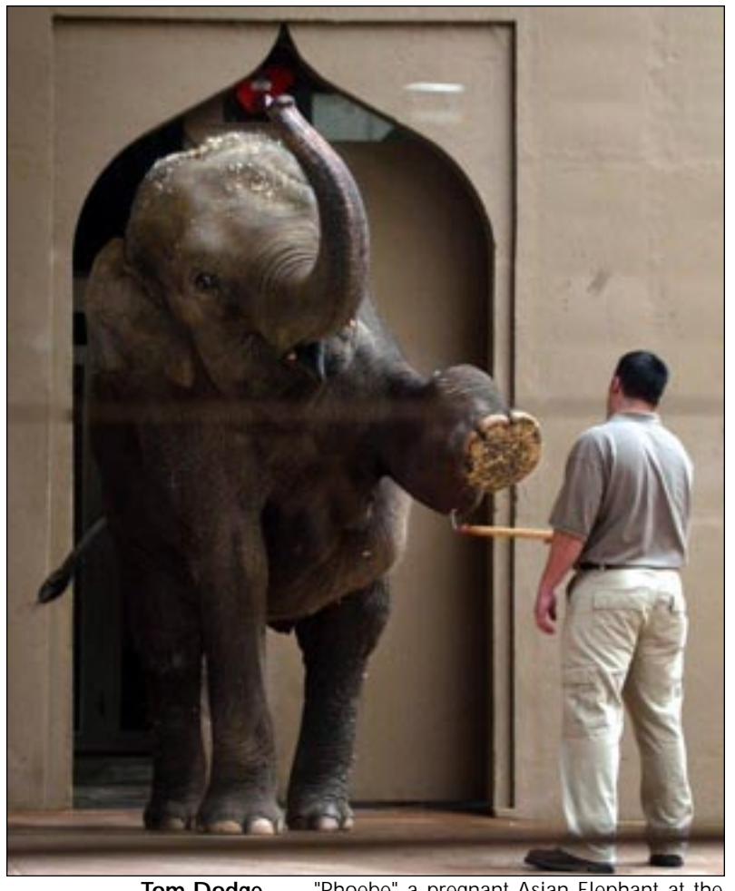
Tom Dodge The Columbus Dispatch 1st General News November