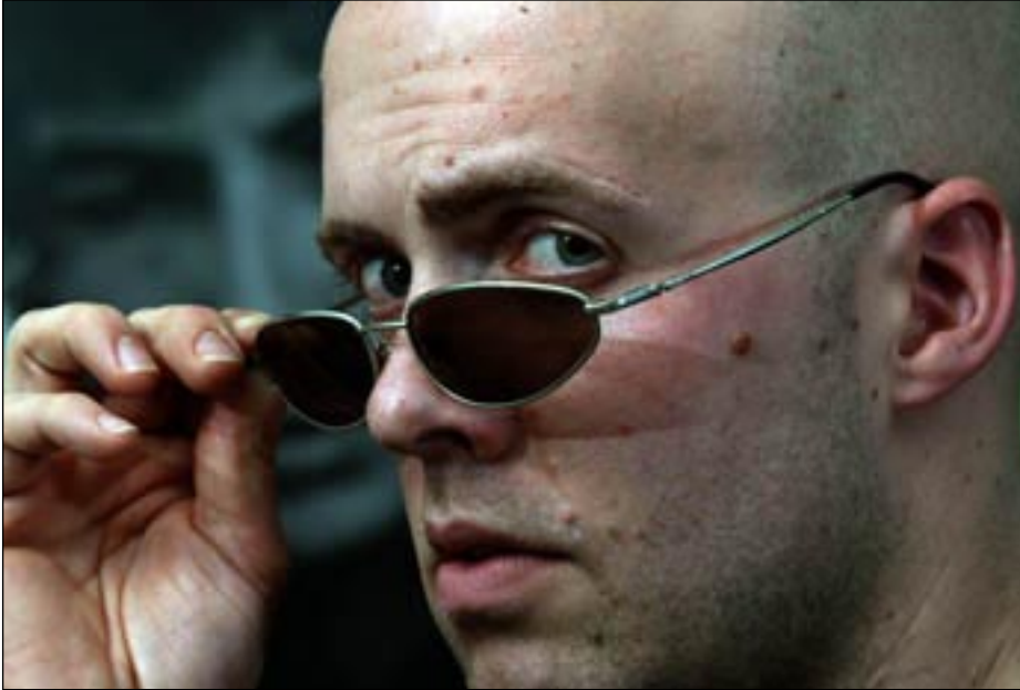
1st Portrait December