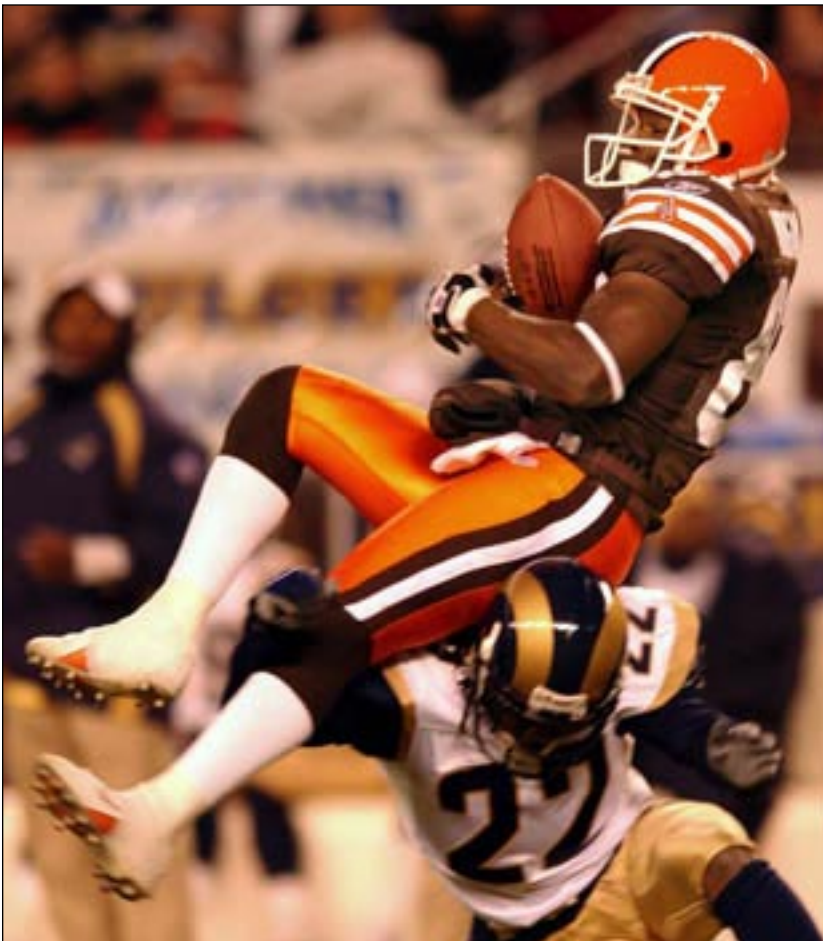
1st Sports December