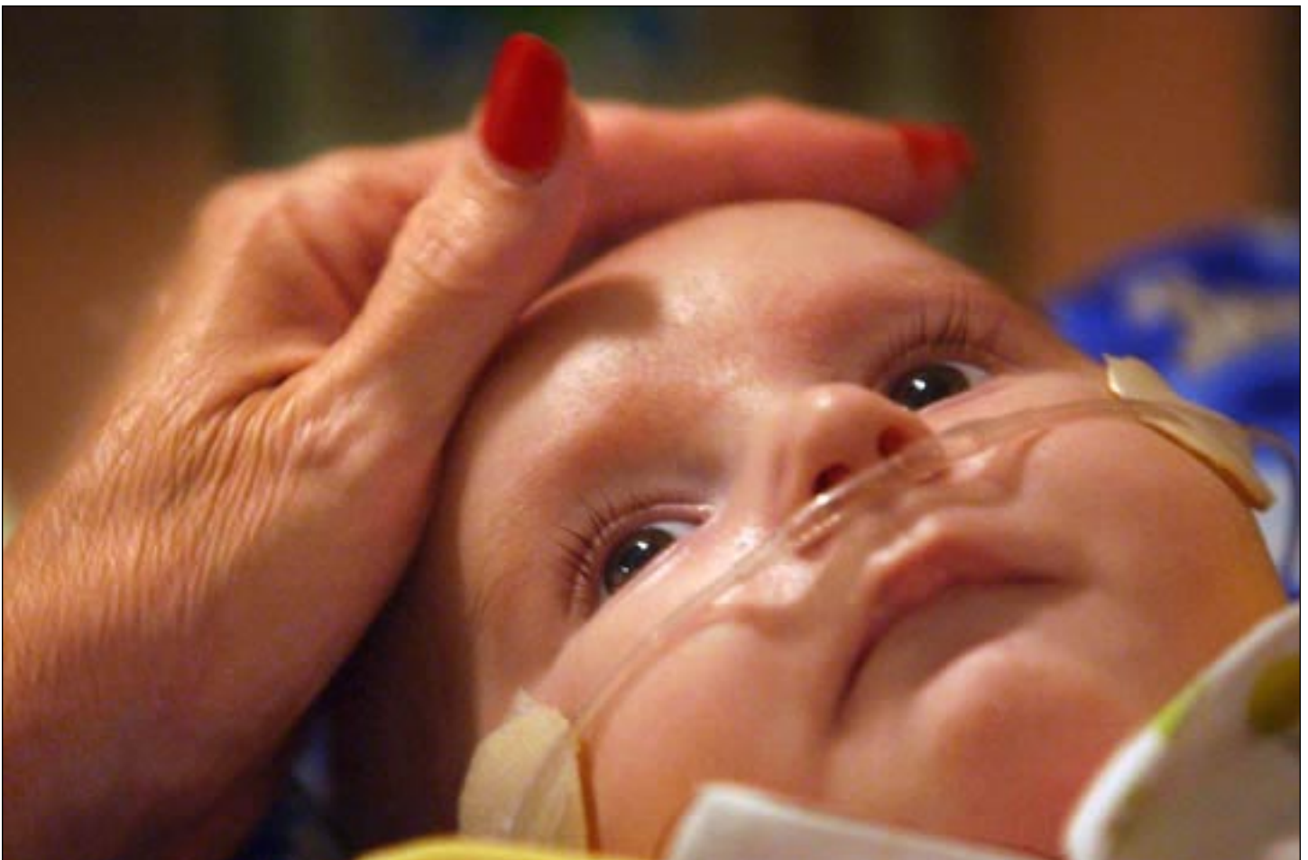
1st Feature story - November