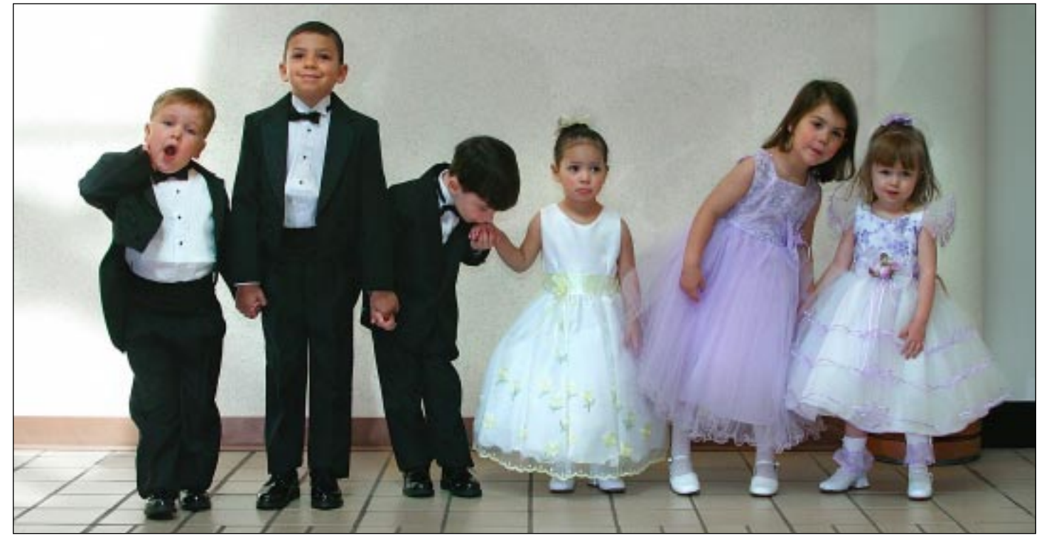
1st Feature -- April