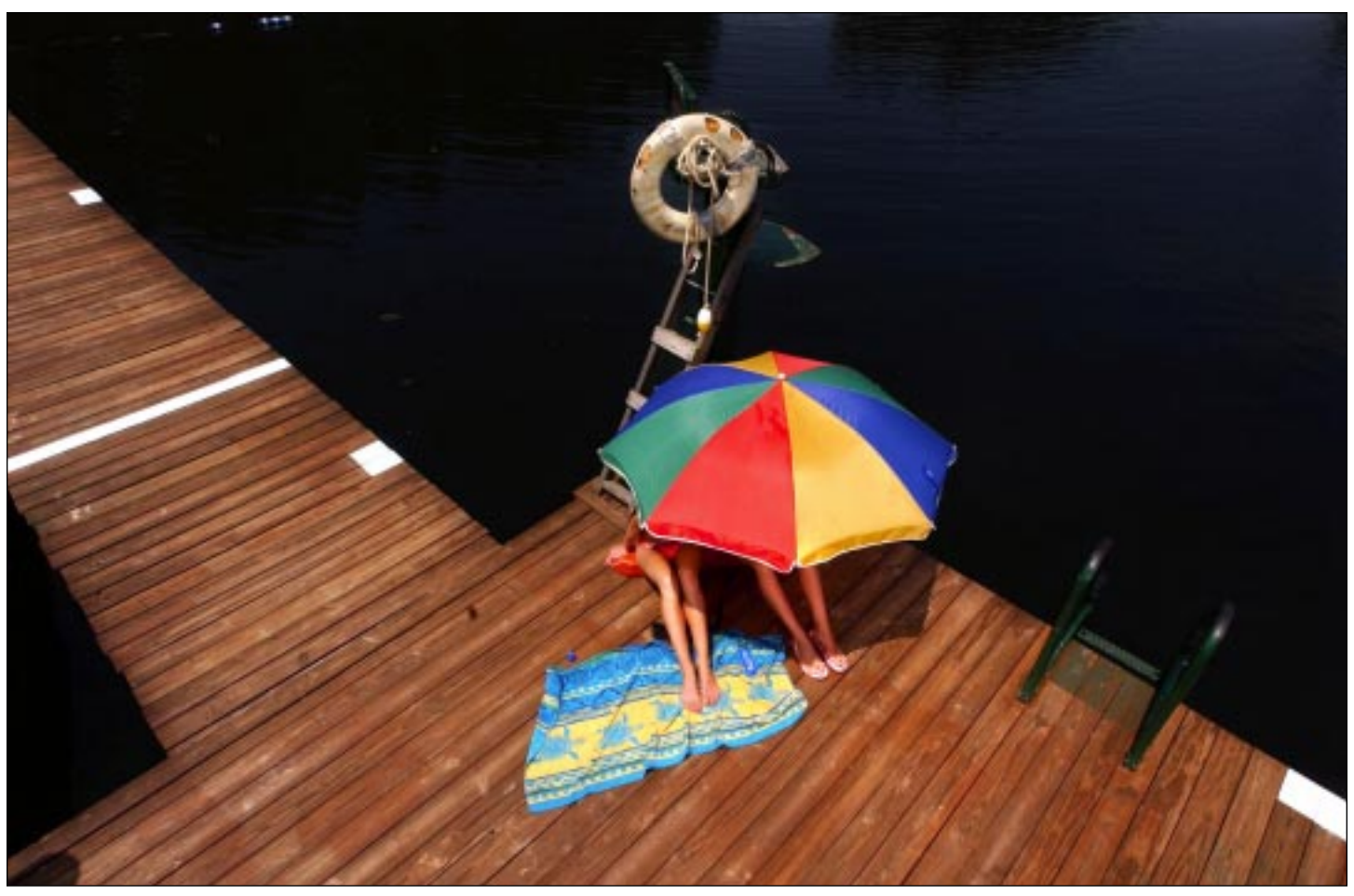
Ken Love Akron Beacon Journal 1st Feature Single -- June