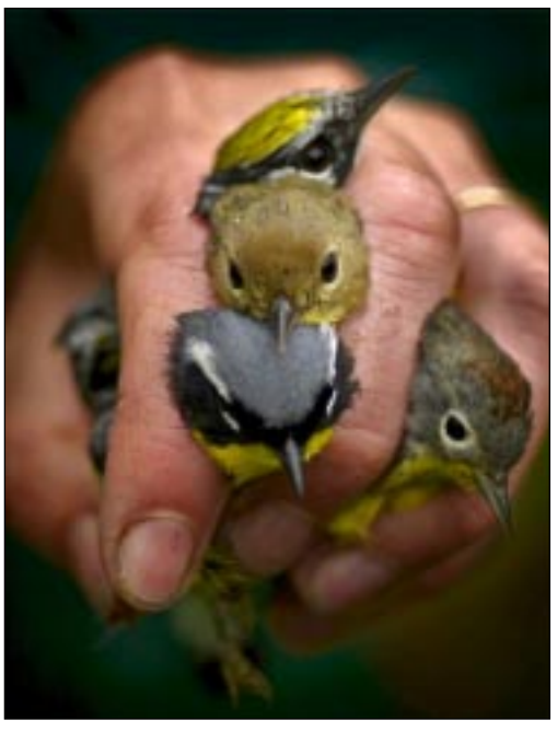
Dale Omori The Plain Dealer