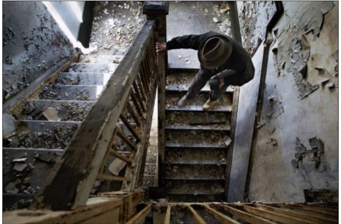
1st General News February