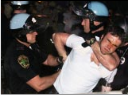
Police arrest a partier along University Ave. in Kent after Mayday festivities got out of hand for the end of the school parties.