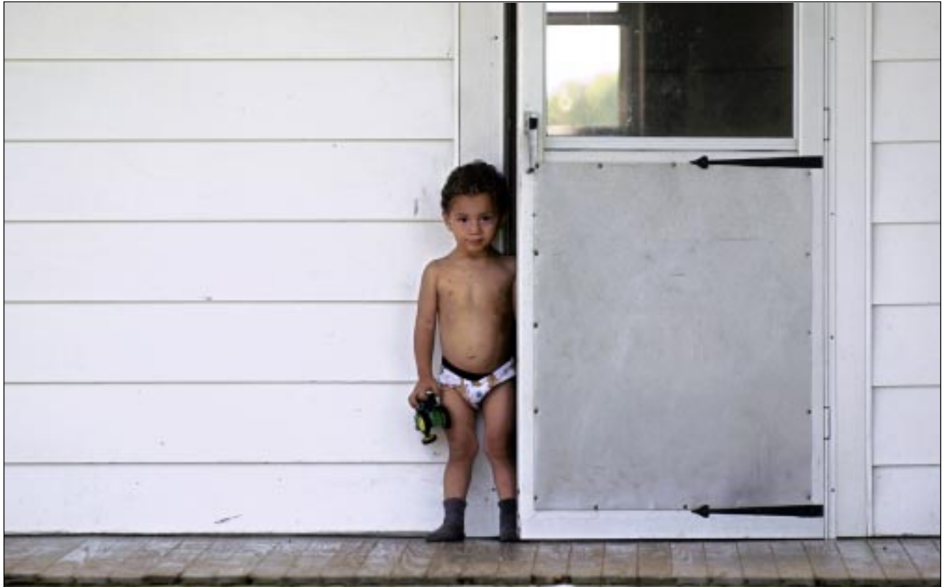
1st Feature Multiple January