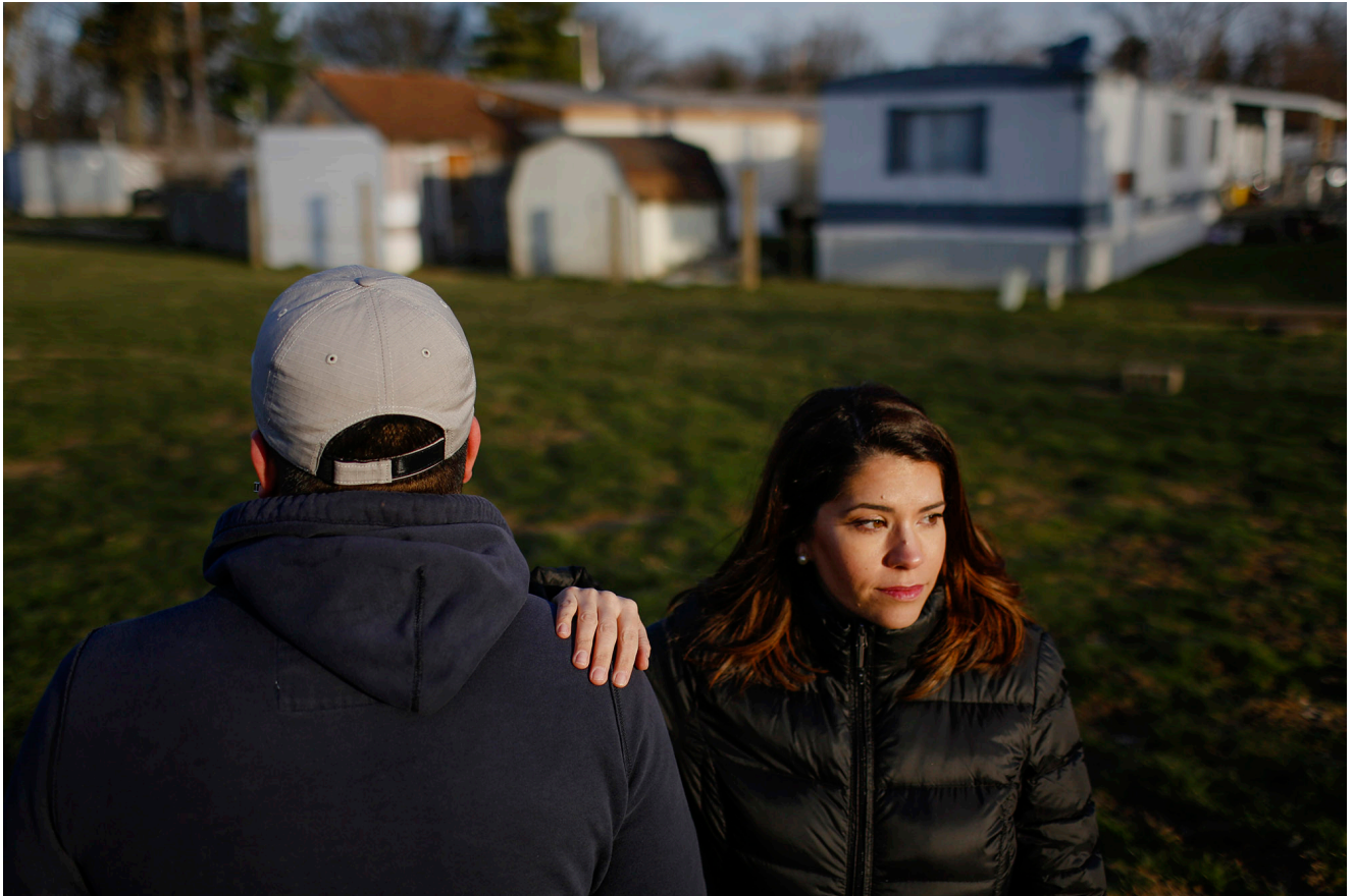
Photo by Joshua A. Bickel, The Columbus Dispatch, 2017 Photographer of the Year - Large Market