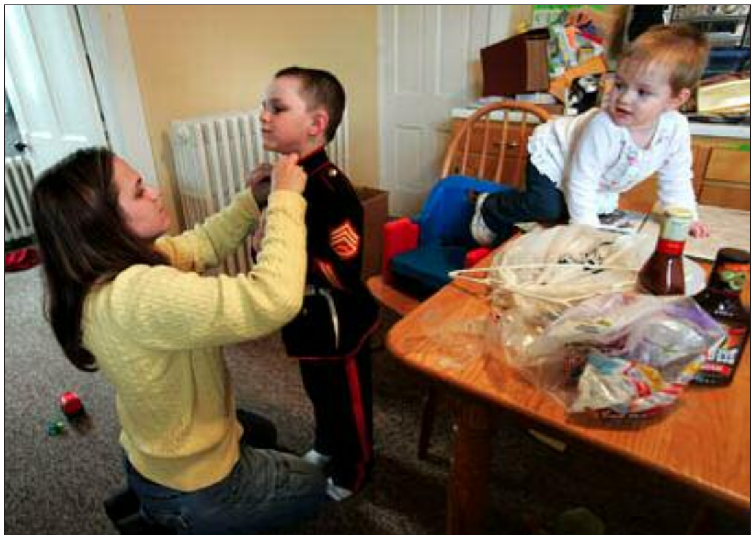
1st Picture Story